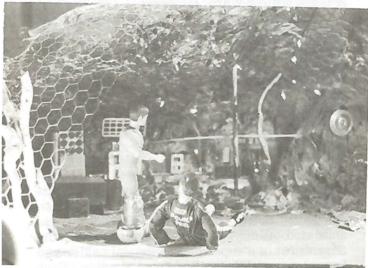
"The Adventures of Deep Powder"